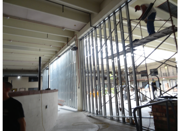
New receiving counter in Central Receiving