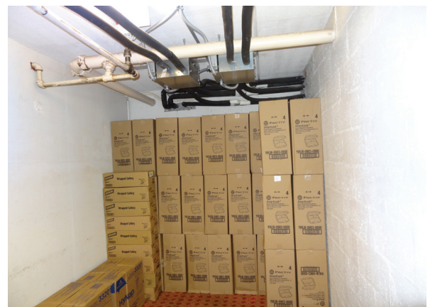
Emergency Supply Closet