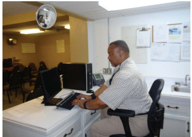
New RSAT Control Office