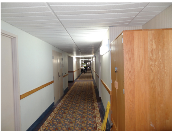
Old RSAT unit is now a work release unit