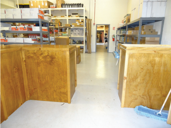
New wall dividing atrium into two areas

New Additions in Residential Substance Abuse Treatment Program areas (RSAT) and other areas of Parkersburg Correctional Center was needed to accommodate additional inmates from Huntington Work Release Center. Please see pictures below of these additions.